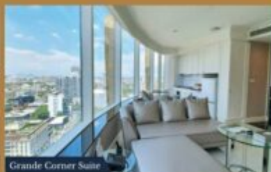
Grande Corner Suite